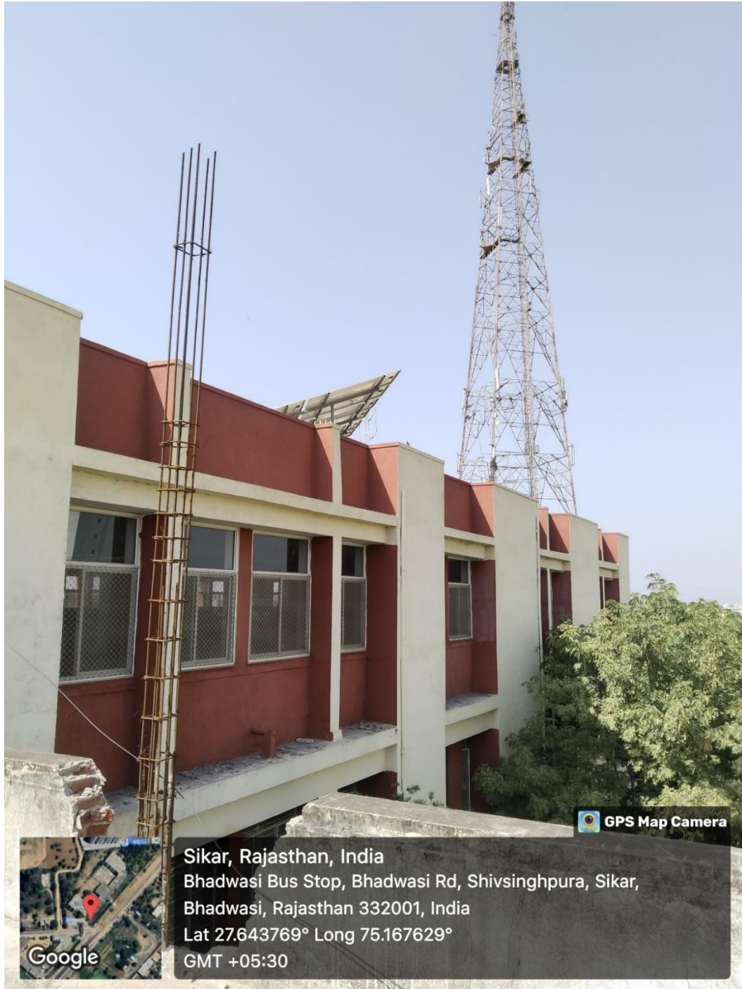
Solar Panel Installed at roof top