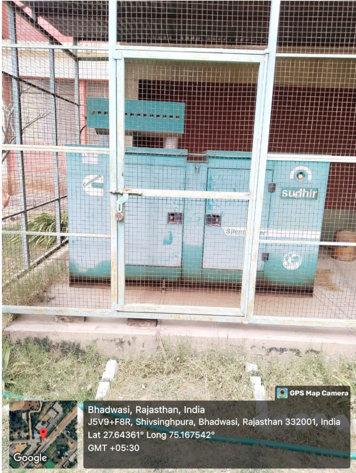
25 KW DG Set operational in campus